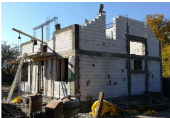
The Sacele Mission Center in Romania is nearing completion.

- Phase 2 involves constructing a sanctuary and ministry area. Once this phase is complete, the buildings now used for worship and ministry will be converted and leased to provide ongoing support to the ministry.