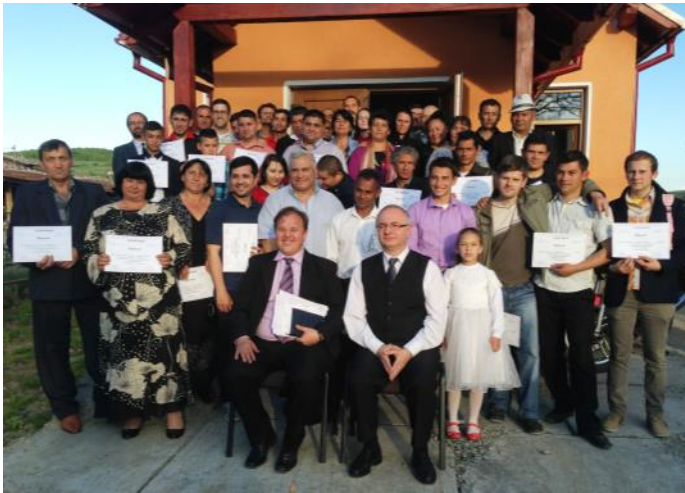
Graduates from the leadership training course receive their diplomas during a special service held over Easter weekend.