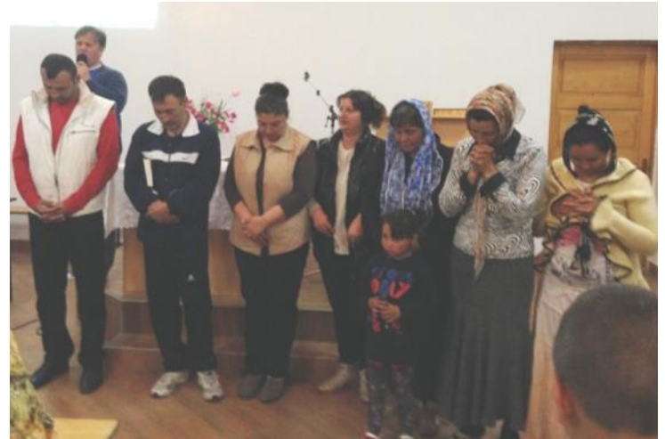
Prayers are lifted up for the Gypsies who have begun to seek work both inside and outside the country.