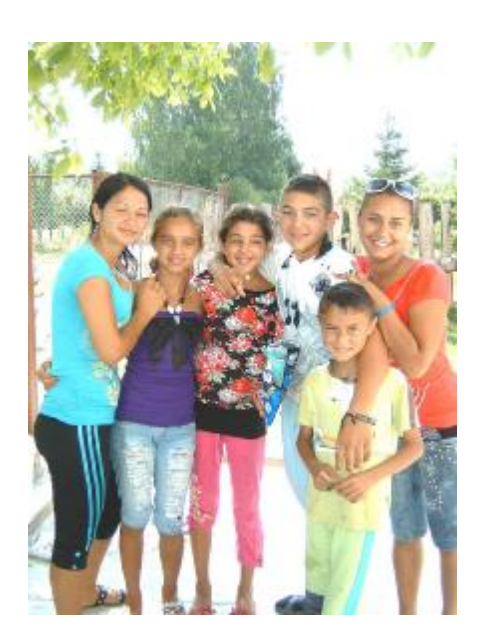
'The Spirit of the Lord will come upon you in power, ... and you will be changed into a different person.' 1 Samuel 10:6

During the evening worship time, five of the older boys (15 year olds) repented and committed to follow Jesus as Lord and