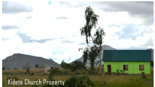
Kidete Church Property