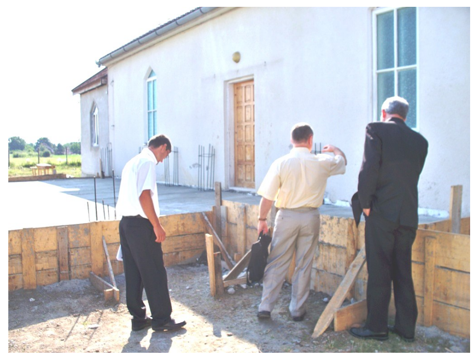
Thanks to a generous donor, the Acas church received the funds needed to buy materials to expand the building to accommodate the growing number of believers.

The church has reached out to the neigh-