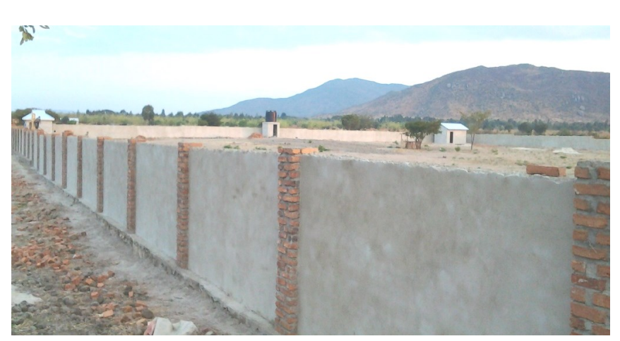
Construction of the security shed, water tank, storage building and wall around the Bread of Life Secondary School have been completed and now work on the school structure can begin.

receive a cup of vitamin-enriched porridge and a lunch consisting of rice, beans (like pinto beans), and greens. Women from the Kidete church cook Continued on page 3