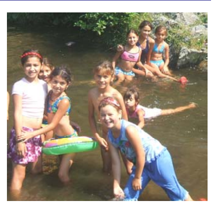
These Roma (Gypsy) children proved that, even though this was their first camp experience, the excitement of attending Summer Camp is universal.