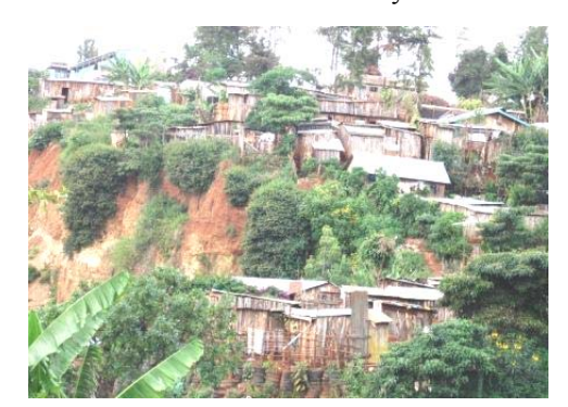
The slum area in Nyeri.

I am very grateful for the opportunity to spend time in Kenya and meet the people. I look forward to returning and working with our church and other leaders to develop a course of action that will allow us to move our individual and corporate resources towards these special people.