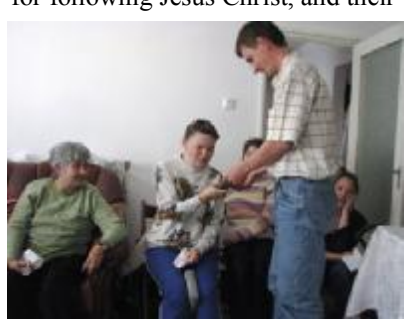
The Hope Group show their love for Jesus by helping each other.